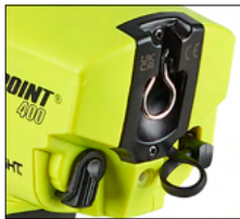
Secondary rotary switch selects high, medium, and low modes