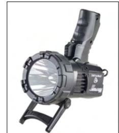
Integrated stand for hands-free lighting