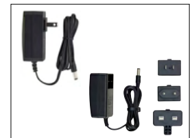
Includes 120V AC or international AC charge cord