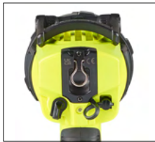
LED charge indicator