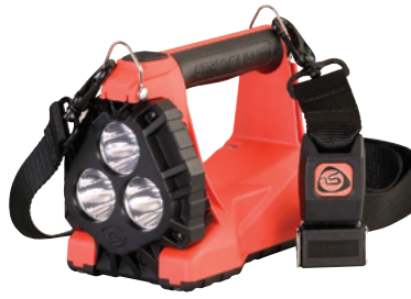
Quick-release strap works like a seatbelt buckle for fast and easy release/connection of shoulder straps