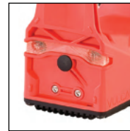
Taillight LEDs ensure you can be seen from behind

Material/Lens Housing made from high-impact, super tough nylon offering exceptional durability. Available in orange or yellow with rubberized cushioned-grip handle. Rotating head constructed from high-grade aluminum incased in super tough nylon. Unbreakable polycarbonate lens with scratch-resistant coating. Gasket-sealed.