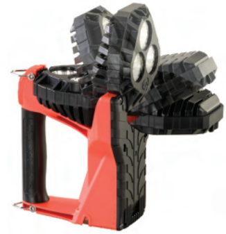
180° articulating head