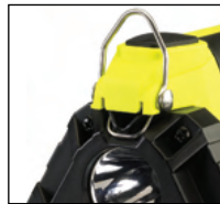
Locking mechanism keeps head in place