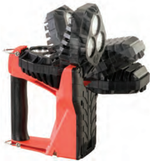
180° articulating head