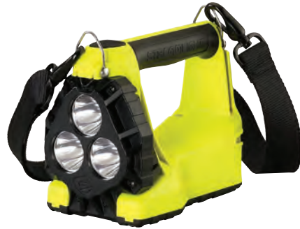
Yellow model includes heavy duty strap Configuration with quick release strap available