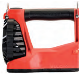
Taillight LEDs ensure you can be seen even from behind Can be programmed on or off