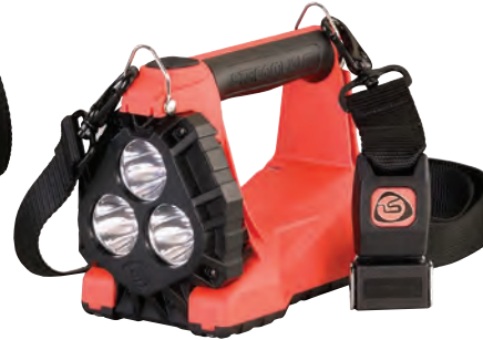
Quick-release strap works like a seatbelt buckle for fast and easy release/connection of shoulder straps