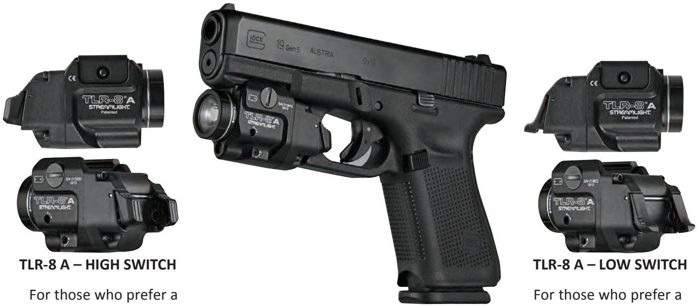
TLR-8 A – HIGH SWITCH

LOW-PROFILE, RAIL MOUNTED TACTICAL LIGHT \ WITH RED LASER AND REAR SWITCH OPTIONS