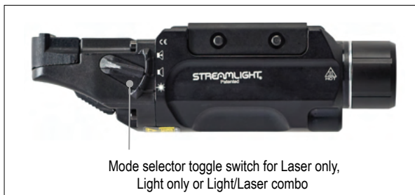
Mode selector toggle switch for Laser only, Light only or Light/Laser combo