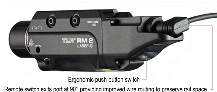
Ergonomic push-button switch