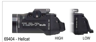
69404 - Hellcat HIGH LOW