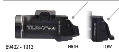
69402 - 1913 HIGH LOW