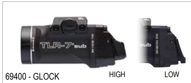
69400 - GLOCK HIGH LOW

Interchangeable paddle switches easy to swap out with multi-tool (included)