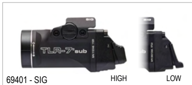
69401 - SIG HIGH LOW