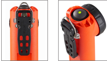
Spring-loaded clip with built in D-ring

CLASS I, DIVISION 1 RATED RIGHT-ANGLE FLASHLIGHT