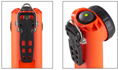
Spring-loaded clip with built in D-ring

BUDGET-FRIENDLY, USB RECHARGEABLE RIGHT-ANGLE FLASHLIGHT