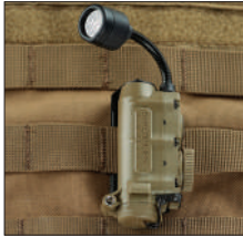
Flexible stalk securely attaches to MOLLE