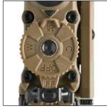
Rotary mode selector switch & IFF beacon