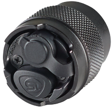
Jack-Cap® provides operational switch redundancy