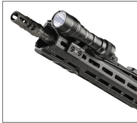
Securely attaches to long guns with MIL-STD-1913 rails