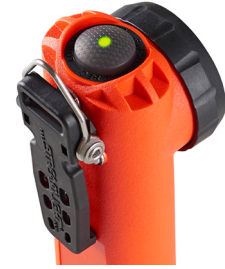
Battery life indicator in switch: — Green indicates full charge — Turns red when battery is nearing low voltage — Flashes red continuously when 15 minutes left of battery life