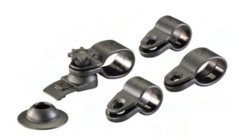
68089 Poly Mount Kit - universal mounting via slot attachment or self-adhesive mount

Includes adapters for mounting: 4AA ProPolymer® Series 3AA ProPolymer® HAZ-LO® 2AA ProPolymer® Series or PolyTac® Series