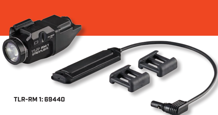
TLR-RM 1: 69440