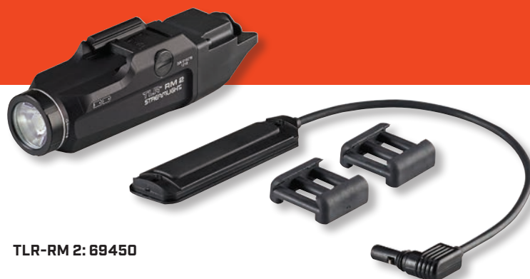
TLR-RM 2: 69450