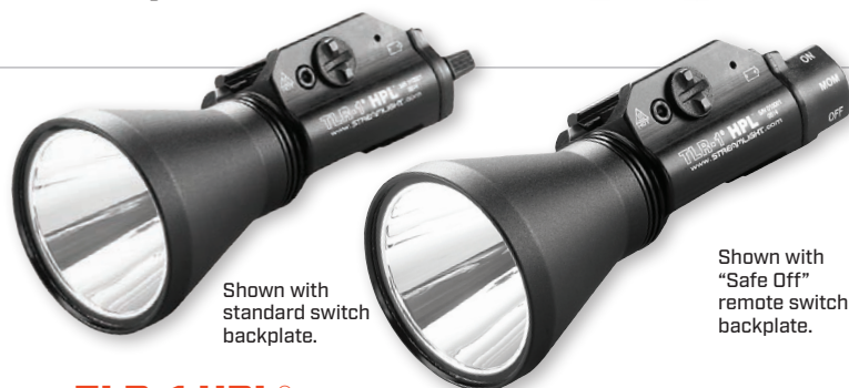
Shown with standard switch backplate.