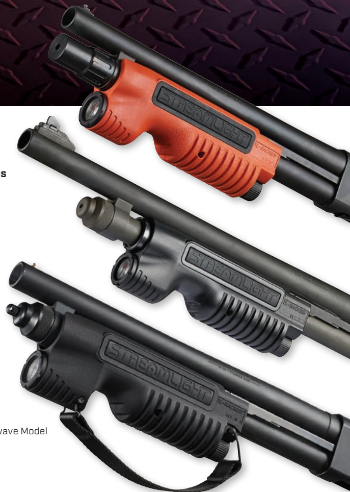
590® Shockwave Model