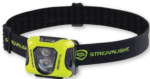
Multi-function push-button switch with charge indicator. Battery charges in approx. 4 hours