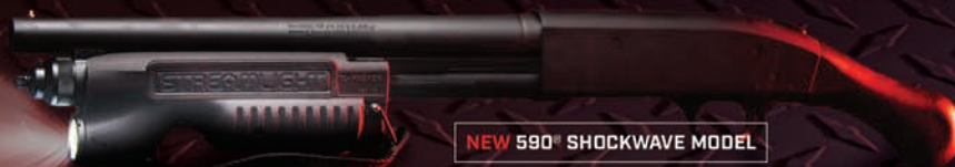
NEW 590® SHOCKWAVE MODEL