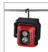
Hands-free applications: 1.) Magnetic base 2.) Stowable hang hook