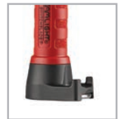
Hands-free applications: Tail-end magnet, Stowable Hang Hook, and Stable Foot.