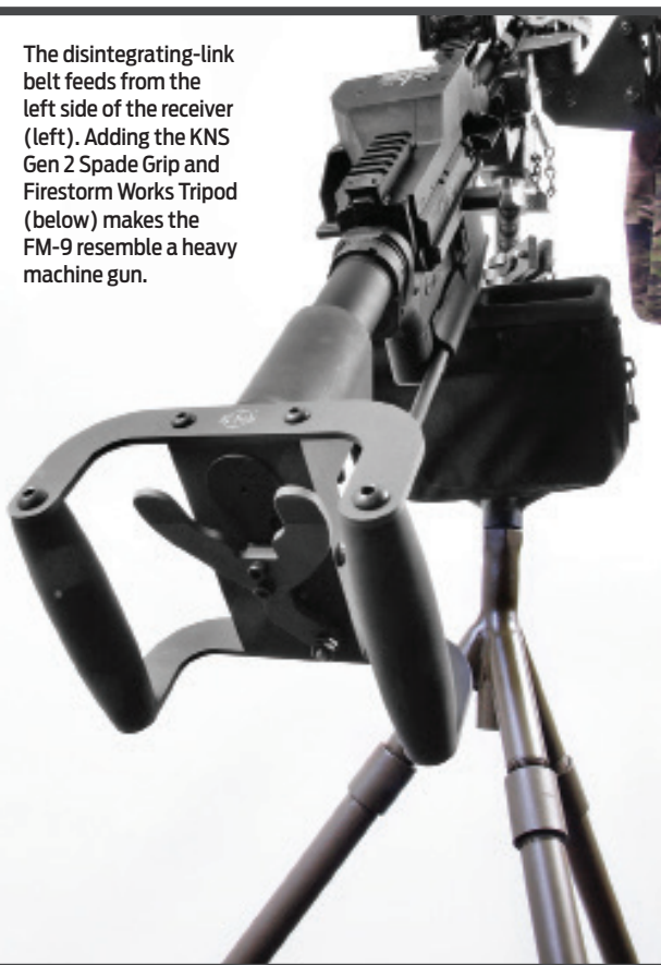
The disintegrating-link belt feeds from the left side of the receiver (left). Adding the KNS Gen 2 Spade Grip and Firestorm Works Tripod (below) makes the FM-9 resemble a heavy machine gun.

numerous steel inserts in high-wear areas, including the pawl, feed tray, bolt travel slot and cam arm assembly, which transmits energy from the moving bolt to advancing the belt with each cycle of the weapon. Each of these steel parts, as well as the bolt and trunnion, are made from heat-treated 4140 chrome-moly steel that has been nitrided for abrasion and corrosion resistance. They are attached with hex-head screws, not rivets or press fits, allowing for easy replacement. The barrel is also nitrided, which explains how one of the company's test barrels still has serviceable rifling after firing 5,000 rounds over several full-auto sessions.