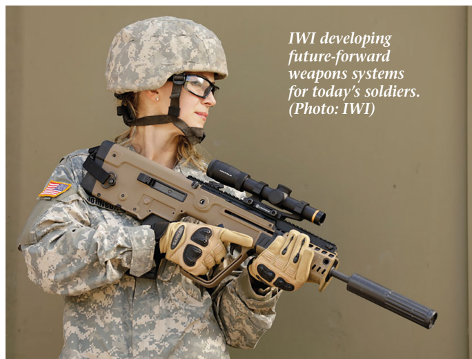
IWI developing future-forward weapons systems for today's soldiers.