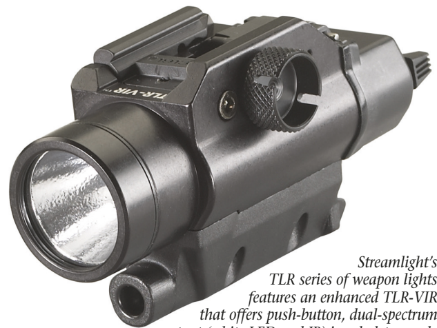
Streamlight's TLR series of weapon lights features an enhanced TLR-VIR that offers push-button, dual-spectrum output (white LED and IR) in a holster-ready size for any military handgun systems.