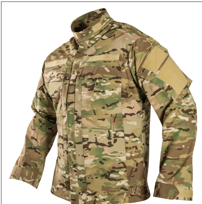
The Recon MultiCam Garrison Shirt offers maximum storage ability in a traditional-style field shirt. Paired with the RECON pants, the RECON MultiCam Garrison Shirt is 50/50 NYCO Ripstop for reinforced durability, with and without additional gear. The RECON MultiCam Garrison Shirt offers multiple pocket configurations for carrying and easily accessing needed essentials.

The Vertx RECON Uniform offers more storage ability, with higher quality construction, at an affordable price versus other competitors in this industry. Plus, with the exclusive benefit of 37.5, this is the only uniform available on the market today to help you conserve energy, sweat less, while staying 5X drier than other performance fabrics.