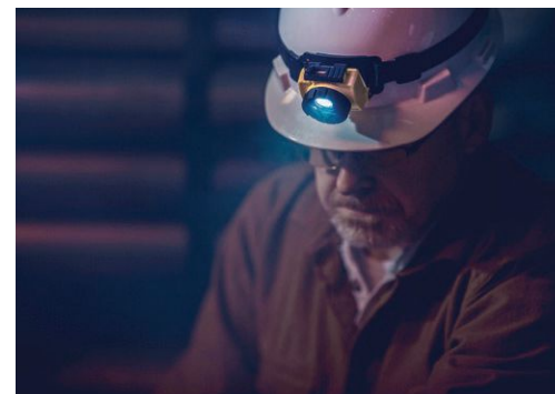
Industrial users can select from a growing number of USB-rechargeable handheld lights, headlamps and work lights, offering extreme brightness and long run times.