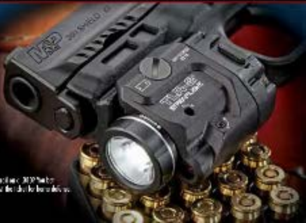
Another M&P feature is the built-in tactical light.