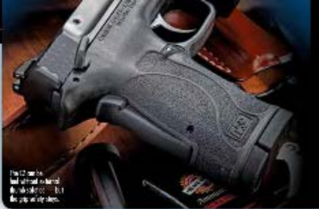
The EZ slide had almost identical dimensions—but the grip was different.

He-ran the line about me being an idiot here. But that was before—now I was an advocate.