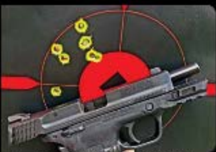
Left: Right grip with Black Hills 50-gr. HoneyBadger 380 A&P 50-gr. solid copper flat lead. Middle: Right grip with S&W 90-gr. M-Crown lead. Right: Left grip with S&W 90-gr. M-Crown lead. Bottom: Right grip with S&W 90-gr. M-Crown lead. All 25-yard groups are 2.5" or less. All 25-yard groups are 2.5" or less. All 25-yard groups are 2.5" or less.