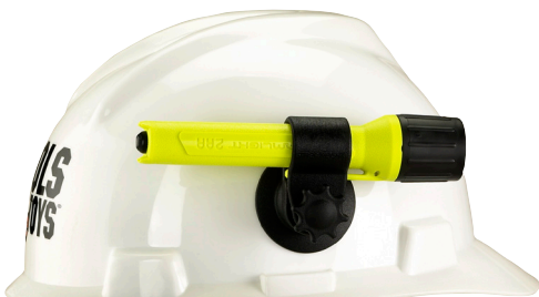
2AA ProPolymer® HAZ-LO®