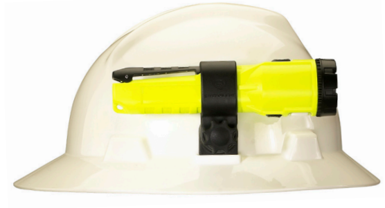
Dualie® 3AA/Dualie® 3AA Color-Rite®