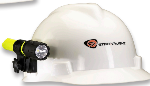
Shown with Dualie 2AA (not included) using slot attachment