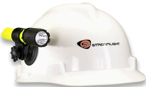
Shown with Dualie 2AA (not included) using adhesive base