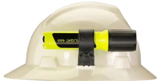
4AA ProPolymer® Lux