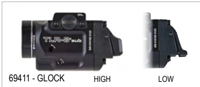
69411 - GLOCK HIGH LOW