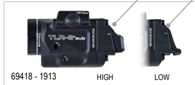
69418 - 1913 HIGH LOW