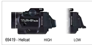
69419 - Hellcat HIGH LOW