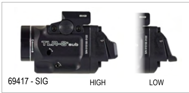
69417 - SIG HIGH LOW