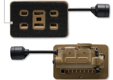
Mount can be configured to wear on either side of helmet