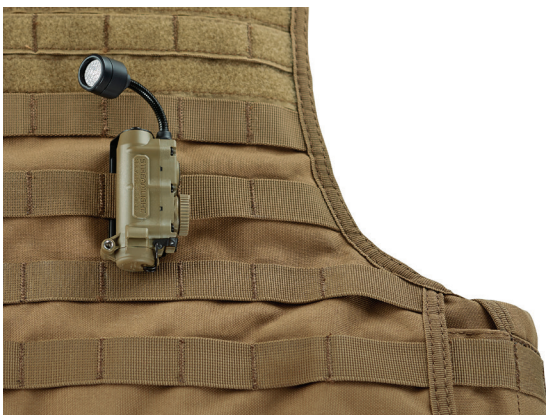
Securely attaches to MOLLE