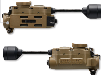
Mount can be configured to wear on either side of helmet