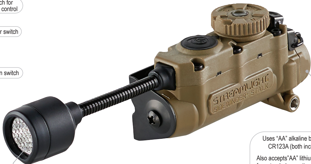
White, red, green, blue and IR LEDs

Uses "AA" alkaline battery or CR123A (both included) Also accepts "AA" lithium batteries for extended operation in extreme temperatures Sidewinder Stalk does not need to be removed from mounted position in order to change batteries